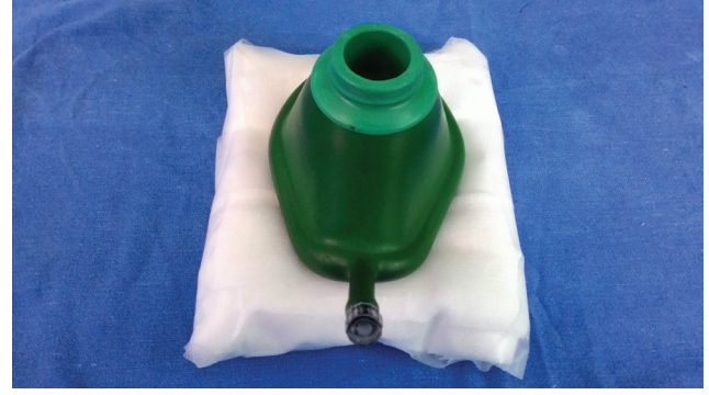
Fig. 2. Standard face mask placed over the central aperture of Raut's face mask support device.