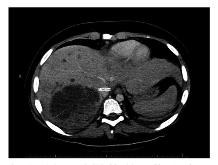
Fig. 2. Computed tomography (CT) of the abdomen with contrast done on admission. This axial view demonstrates the largest loculation the patient had, located in the right hepatic lobe.

Our patient's abscess cultures showed multiple gut bacteria, supporting that his bacteremia originated from the gut. As in our case, this bacteremia can develop into pylephlebitis or cause bacterial seeding into the liver. A suppurative