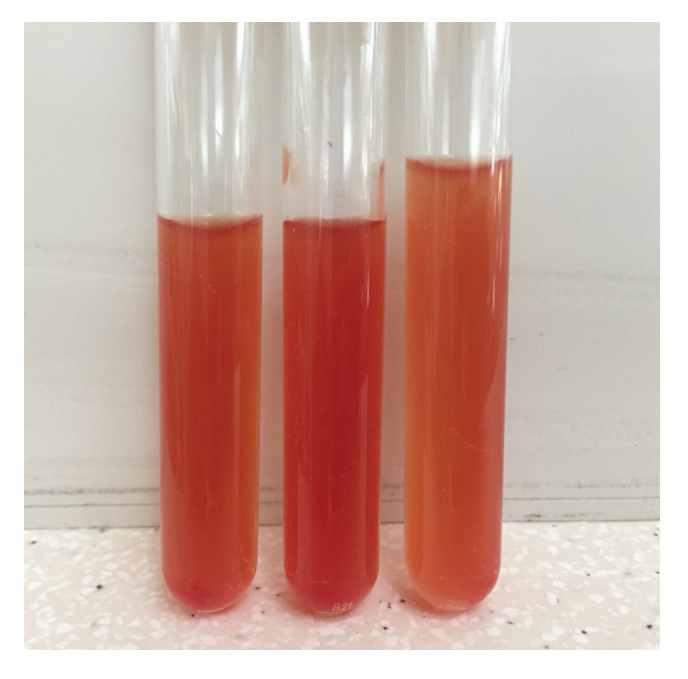
Fig. 2. Cerebrospinal fluid obtained 7 days after CPR. From left to right: the 1<sup>st</sup>, 2<sup>nd</sup> and the 3<sup>rd</sup> tube of cerebrospinal fluid. Abbreviation: CPR, cardiopulmonary resuscitation.

main pathophysiological processes that occur during cardiac arrest and resuscitation, and can cause damage to multiple organs (circu). Brain injury, myocardial dysfunction, and the systemic ischemia/reperfusion response are the major symptoms that present during the post-arrest period. Among them, brain injury is a cause of death after resuscitation. Neurological complications of CPR mainly include hypoxic-ischemic encephalopathy, infarcts, and brain edema.<sup>4</sup> SAH as a complication of CPR has been rarely reported (Table 1<sup>5,6</sup>).